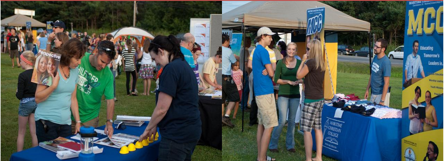
It was great having a number of ministry partners join us this year. Thanks to the many who came!