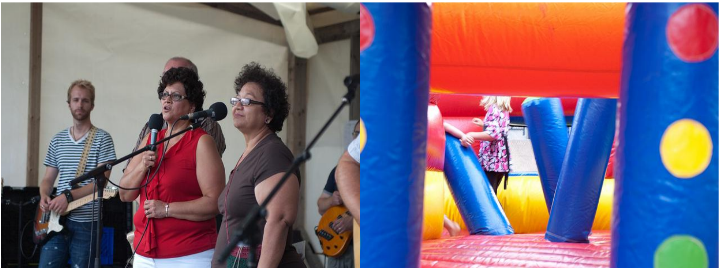
Thanks to BuildAClassroom.com for sharing with us, and Hope Community Church for sponsoring the Kids Zone