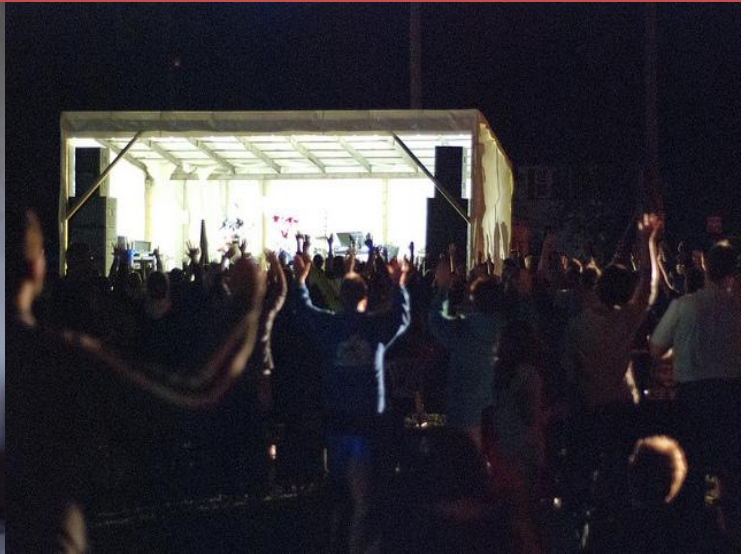
Paul led the crowd in the universal sign of surrender