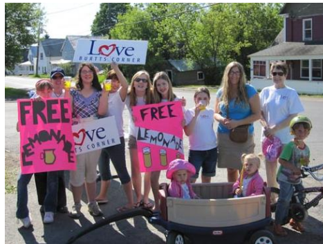
The lemonade gang gave out over 80 cups at Bird's Store.