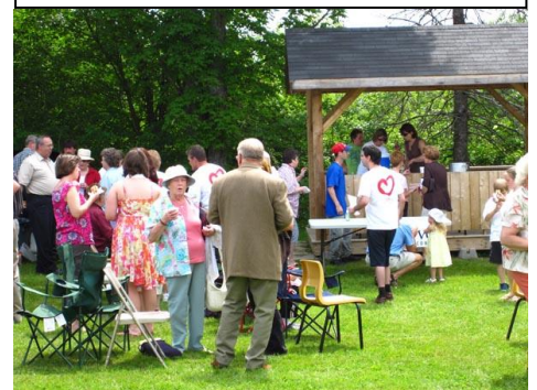
The BBQ'd hot dogs, hamburgers, and homemade pies were a hit on Sunday.