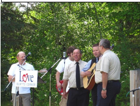
The Gospel Way performed a few special songs during the Sunday Service.