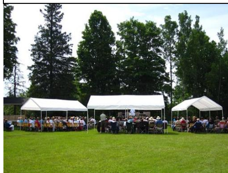
The largest crowd to date gathered for the Love Burtt's Corner Sunday Service.